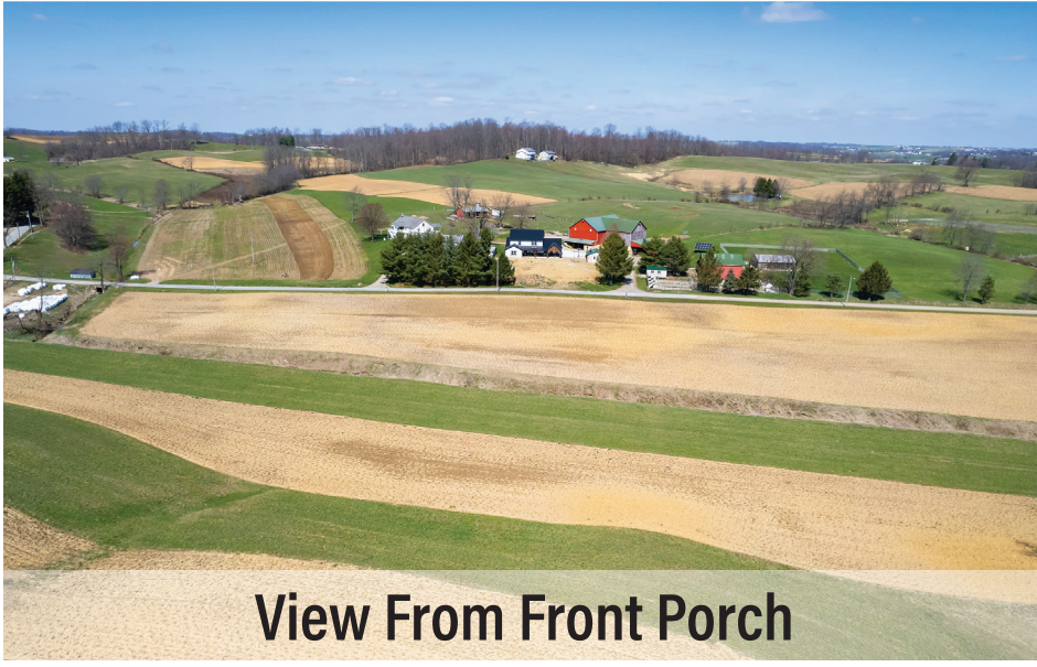
View From Front Porch